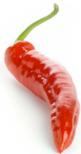
Average fruit weight (gr)