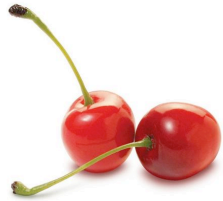
Fruits with diameter superior to 28 mm (%)